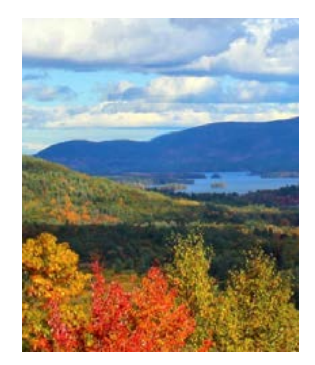
Ida Gould, 2016

benefit from greater opportunity for professional growth due to the continued growth of our combined companies.